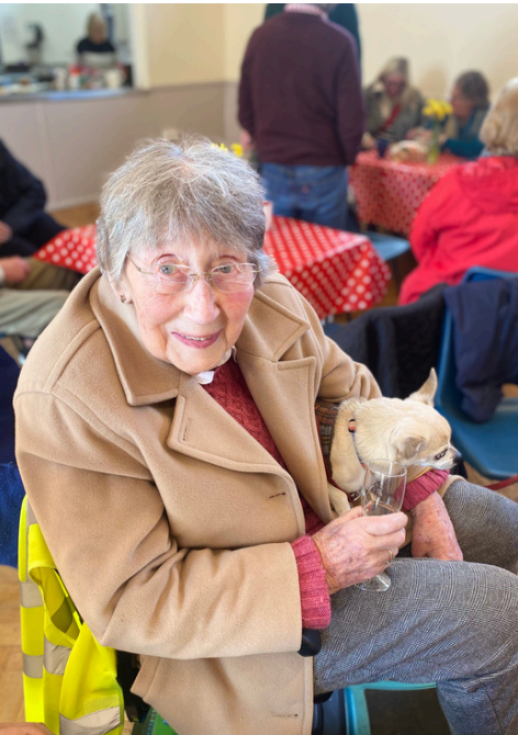
Chart Coffee Mornings

This is a very worthwhile annual activity that brings colour, pride and a great sense of community to the Limpsfield residents and businesses.